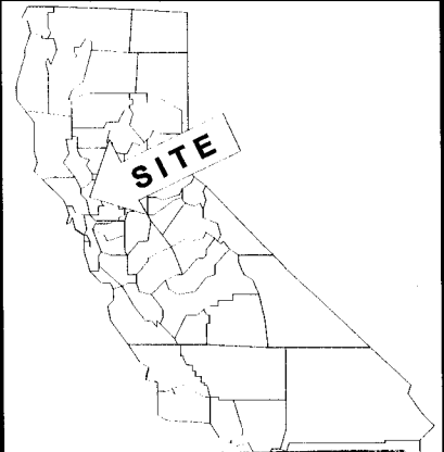
Exhibit A WP 5694 GL-Recreational Pier Petaluma River SONOMA COUNTY

Ten Foot use area around pier, deck and dock