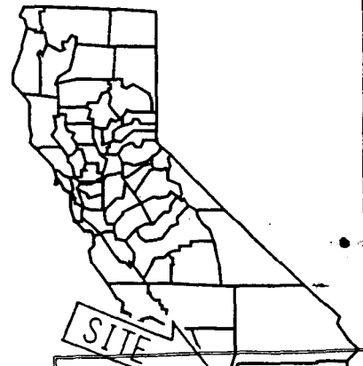
EXHIBIT "A" LOCATION MAP WP 5245 3542 VENTURE DRIVE HUNTINGTON BEACH ORANGE COUNTY, CA.