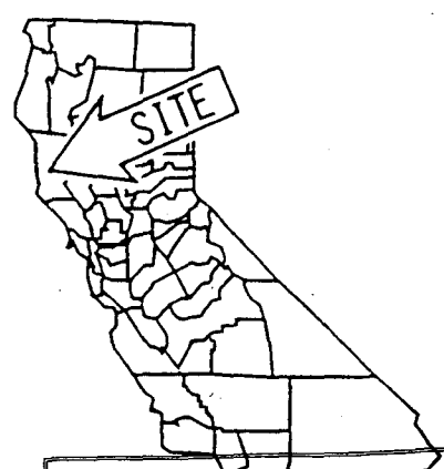
EXHIBIT "A" W25510 DREDGING PUBLIC AGENCY USE MENDOCINO COUNTY CALIFORNIA