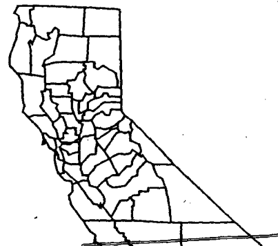
EXHIBIT "A" SITE MAP WP 5244.9 3532 VENTURE DRIVE HUNTINGTON BEACH ORANGE COUNTY, CA.

CALENDAR PAGE 000203 SITE MINUTE PAGE 005257