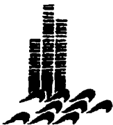
Exhibit A CITY OF LONG BEACH DEPARTMENT OF OIL PROPERTIES