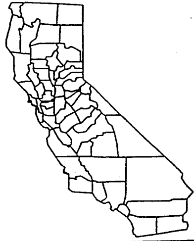
EXHIBIT "A" SITE MAP PRC 7898 DREDGING LEASE NATIONAL CITY SAN DIEGO COUNTY