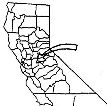
EXHIBIT A PRC 5349.1