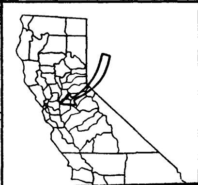
EXHIBIT A PRC 3978