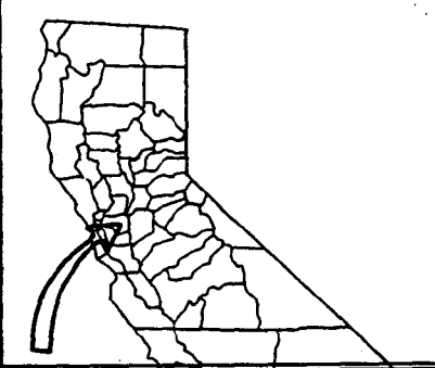
Exhibit B WP 402