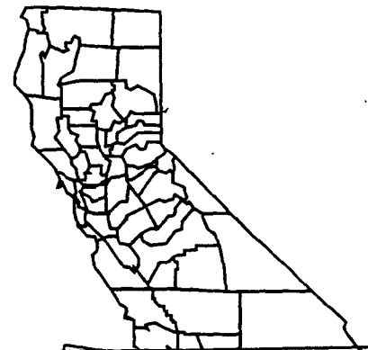
EXHIBIT "A" LOCATION MAP WP5550.9 3552 VENTURE DRIVE HUNTINGTON BEACH ORANGE COUNTY, CA.

SITE 422 CALENDAR PAGE MINUTE PAGE 004495 CNP 07