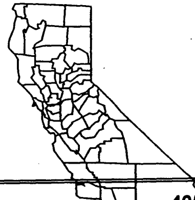
EXHIBIT "A" LOCATION MAP WP 4443.9 16581 CAROUSEL LANE HUNTINGTON BEACH ORANGE COUNTY, CA.