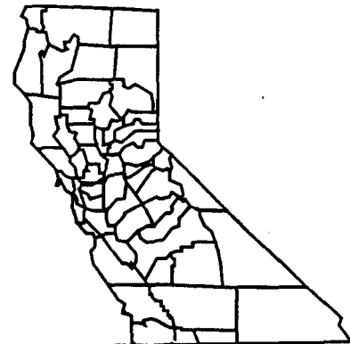
EXHIBIT "A" LOCATION MAP WP4098,9 16571 CAROUSEL LANE HUNTINGTON BEACH ORANGE COUNTY, CA.