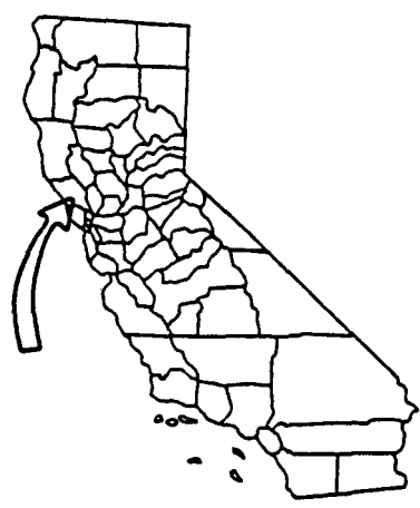
Exhibit B W 25446