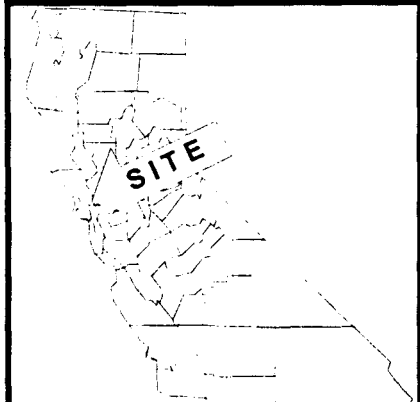
Exhibit A W 25481 Recreational Pier Corte Madera Creek MARIN COUNTY

This Exhibit is solely for purposes of generally defining the lease premises, and is not intended to be, nor shall it be construed as, a waiver or limitation of any State interest in the subject or any other property.