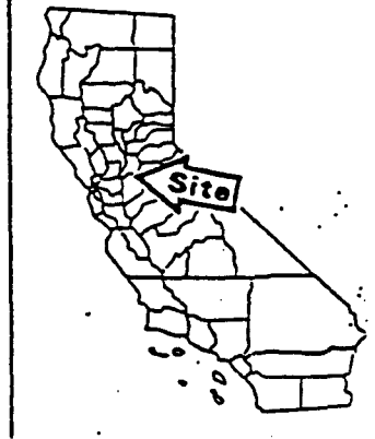
EXHIBIT "A" LOCATION MAP PRC 5107

This exhibit is solely for purposes of generally defining the area to be leased, and is not intended to be, nor shall it be construed as, a waiver or limitation of any State interest in the subject or other property.