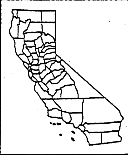
EXHIBIT B PRC 5381.9

190 004261 MINUTE PAGE SACRAMENTO SAN JOAQUIN