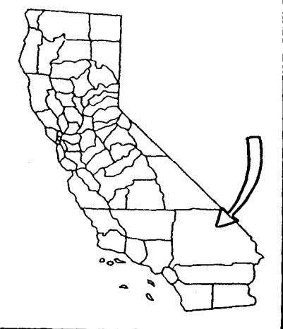
EXHIBIT A PRC 4027.2