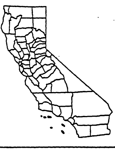
Exhibit B WP 5552