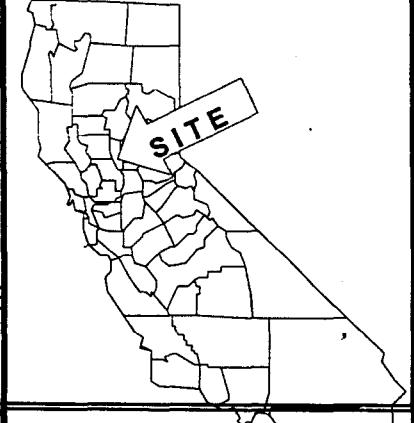
Exhibit A-2 W25484 Calpipe Corp. Pipeline Sacramento River Yolo & Sutter Counties

This Exhibit is solely for purposes of generally defining the lease premises, and is not intended to be, nor shall it be construed as, a waiver or limitation of any State interest in the subject or any other property.