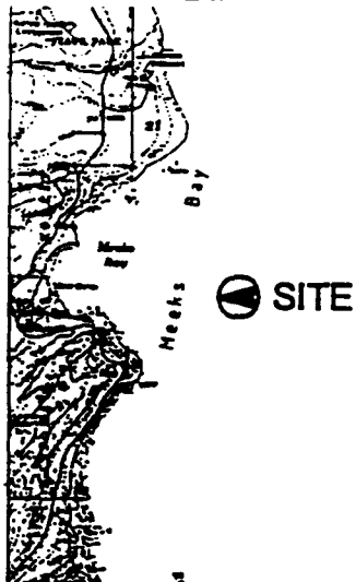
Exhibit A PRC 4266 APN 016-300-381 Lake Tahoe EL DORADO COUNTY