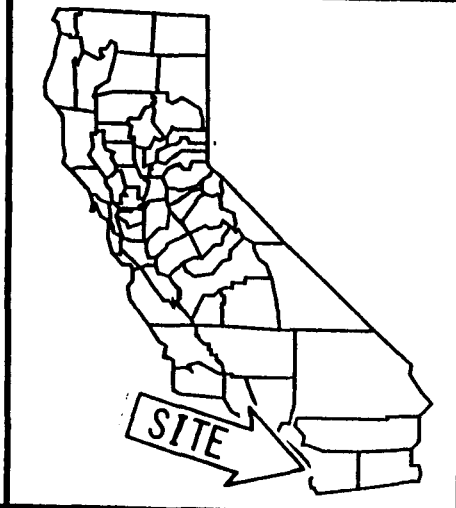
EXHIBIT "A" SITE MAP W 25409 - WP 7987 DREDGING LEASE PORT OF SAN DIEGO SAN DIEGO, CA.