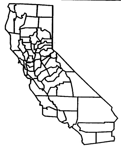
EXHIBIT "A" SITE MAP W 25409 - WP 7987 DREDGING LEASE PORT OF SAN DIEGO SAN DIEGO, CA.