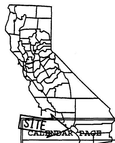
EXHIBIT "A" SITE MAP — PRC 3080.9 3422 GILBERT DRIVE CITY OF HUNTINGTON BEACH ORANGE COUNTY, CALIFORNIA