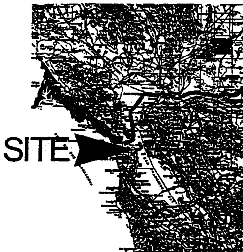
Exhibit A PRC 2036 Sand & Gravel Extraction San Francisco Bay Vic. of Angel Island San Francisco & Marin Counties.