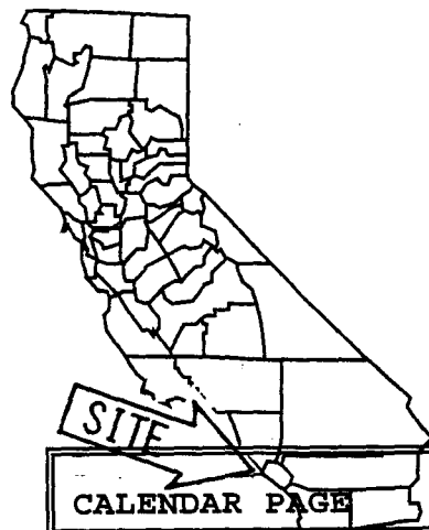
EXHIBIT "A" SITE MAP -- WP 3312.9 3392 GILBERT DRIVE CITY OF HUNTINGTON BEACH ORANGE COUNTY, CALIFORNIA