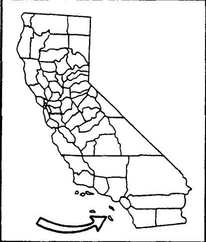
EXHIBIT A PRC 6442