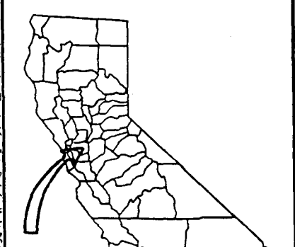
Exhibit B W40754