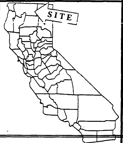
EXHIBIT "A" W 40722 Geothermal Lease Medicine Lake SISKIYOU COUNTY

This Exhibit is solely for purposes of generally defining the lease premises, and is not intended to be, nor shall it be construed as, a waiver or limitation of any State interest in the subject or any other property.