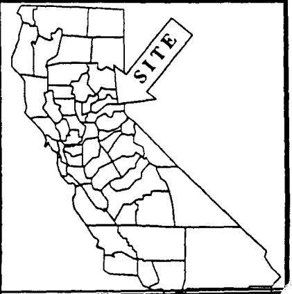
Exhibit A W 8670.20 APN 17 - 381 - 10 Donner Lake NEVADA COUNTY

This Exhibit is solely for purposes of generally defining the lease premises, and is not intended to be, nor shall it be construed as, a waiver or limitation of any State interest in the subject or any other property.