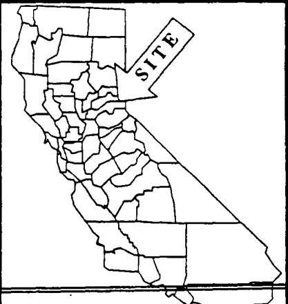
Exhibit A W 8670.13 APN 17 - 390 - 09 Donner Lake NEVADA COUNTY

This Exhibit is solely for purposes of generally defining the lease premises, and is not intended to be, nor shall it be construed as, a waiver or limitation of any State interest in the subject or any other property.