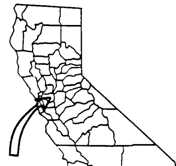
Exhibit B WP 5526