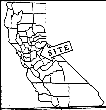
EXHIBIT "A" Site Map PRC 5409.1 TUOLUMNE RIVER STANISLAUS COUNTY