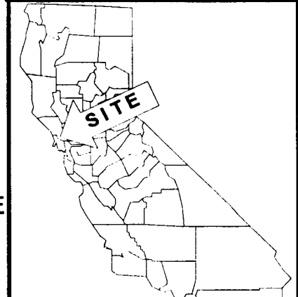
Exhibit "A" WP7041 GL-Recreational Pier & Boat Ramp Napa River NAPA COUNTY

This Exhibit is solely for purposes of generally defining the lease premises, and is not intended to be, nor shall it be construed as, a waiver or limitation of any State interest in the subject or any other property.