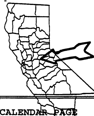
Exhibit A W 25304

This Land description is solely for purposes of generally defining the lease premises, and is not intended to be, nor shall it be construed as, a waiver or limitation of any State interest in the subject or any other property.