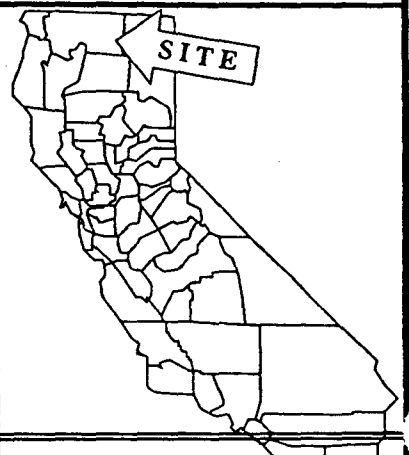
EXHIBIT "A" W 40722 Geothermal Lease Medicine Lake SISKIYOU COUNTY

This Exhibit is solely for purposes of generally defining the lease premises, and is not intended to be, nor shall it be construed as, a waiver or limitation of any State interest in the subject or any other property.