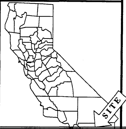
EXHIBIT "A" W 40695 APNs 747-430-5; 747-440-8, 21,22,24,26,27,29,31,32,33 RIVERSIDE COUNTY

This Exhibit is solely for purposes of showing the area affected by the Settlement Agreement, and is not intended to be, nor shall it be construed as, a waiver or limitation of any State interest in the subject or any other property.