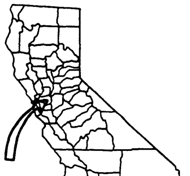
EXHIBIT "B" PRC 5806.1