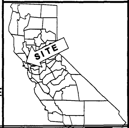
EXHIBIT "A" WP 2651 GL - Recreational & Residential Use Petaluma River MARIN COUNTY

This Exhibit is solely for purposes of generally defining the lease premises, and is not intended to be, nor shall it be construed as, a waiver or limitation of any State interest in the subject or any other property.