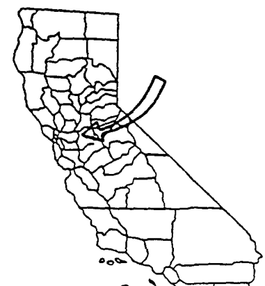
EXHIBIT "B" W-40724