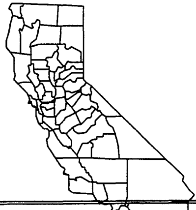
EXHIBIT "A" PRC 3076.9 LOCATION MAP 3262 GILBERT DRIVE HUNTINGTON BEACH ORANGE COUNTY