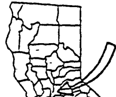
EXHIBIT "B" WP 6998