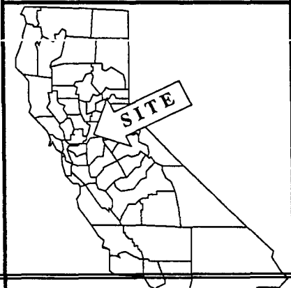
EXHIBIT "A" W 40734 Oil & Gas Lease Sacramento River in Sec. 8,16,17, T5N,R4E,MDM SACRAMENTO COUNTY

CALENDAR PAGE 775 MINUTE PAGE 002260 CG 5796