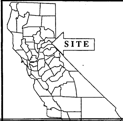
EXHIBIT "A" W 8670.116 APN 17 - 160 - 25 Donner Lake NEVADA COUNTY

This Exhibit is solely for purposes of generally defining the lease premises, and is not intended to be, nor shall it be construed as, a waiver or limitation of any State interest in the subject or any other property.