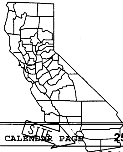
EXHIBIT "A" LOCATION MAP 16681 CAROUSEL LANE HUNTINGTON BEACH ORANGE COUNTY