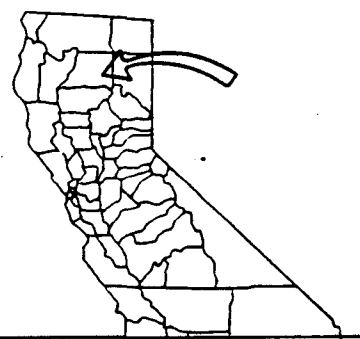
EXHIBIT "B" WP 3353