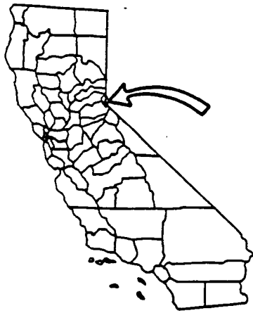
EXHIBIT "A" WP 5300