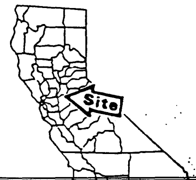
EXHIBIT "A" LOCATION MAP PRC 5107

MONTEZUMA SLOUGH CROSSING (SEE SHEET 4) LAT. = 38°07'10"N LONG. = 121°54'16"W.