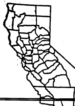
EXHIBIT "C" PRC 6996