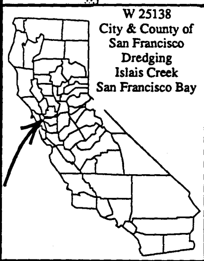
EXHIBIT "B" Location Map

This Exhibit is solely for purpose of generally defining the lease premise, and is not intended to be, nor shall it be construed as, a waiver or limitation of any State interest in the subject or any other property.