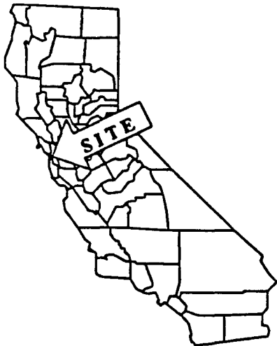
EXHIBIT "A" Site Map W 25138 Dredging Islais Creek City & County of SAN FRANCISCO