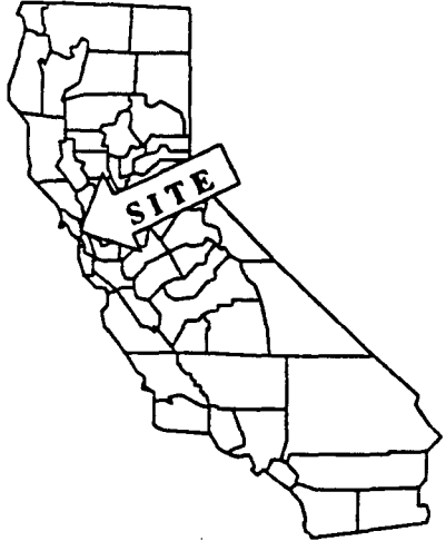
EXHIBIT "A" Site Map WP 5805 Dredging Long Wharf, Chevron Richmond Refinery San Francisco Bay Contra Costa Co.

NOTE: THIS EXHIBIT IS SOLELY FOR THE PURPOSE OF GENERALLY DEFINING THE LEASE PREMISE, AND IS NOT INTENDED TO BE, NOR SHALL IT BE CONSTRUED AS, A WAIVER OR LIMITATION OF ANY STATE INTEREST IN THE SUBJECT OR ANY OTHER PROPERTY.